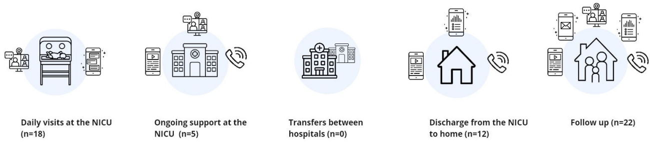
Figure 3. Overview of included telemedicine interventions for each step in the neonatal care journey. NICU: neonatal intensive care unit.